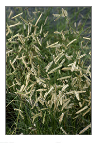
Blue Grama flowers

Blue Grama is an herbaceous perennial with tall flower stalks held atop a low mound of foliage. It brings an extremely fine and delicate texture to the garden composition and should be used to full effect.