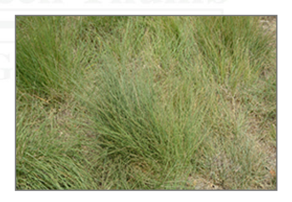
Blue Grama

This is a relatively low maintenance plant, and is best cleaned up in early spring before it resumes active growth for the season. It is a good choice for attracting birds to your yard. Gardeners should be aware of the following characteristic(s) that may warrant special consideration;