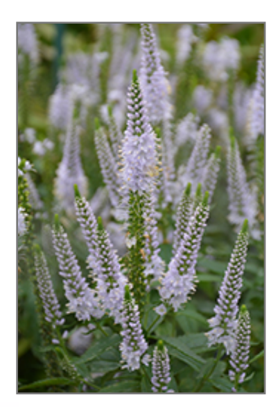
First Memory Speedwell flowers

Very easy to grow and virtually maintenance-free; flower spikes are tightly bunched and upright, producing lovely, long flowering, soft blue flowers from the bottom up; makes an ideal garden accent, great in rock gardens