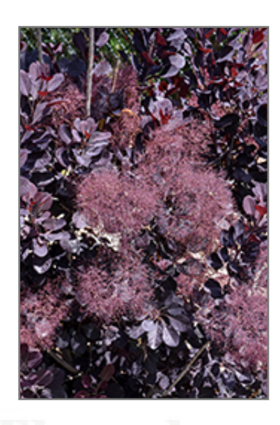
Velveteeny Purple Smokebush flowers

Velveteeny Purple Smokebush is recommended for the following landscape applications;