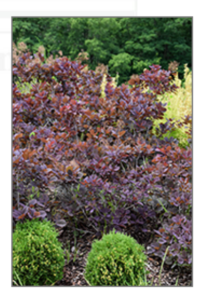
Velveteeny Purple Smokebush