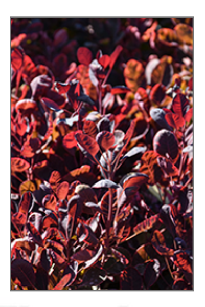
Velveteeny Purple Smokebush foliage

Velveteeny Purple Smokebush makes a fine choice for the outdoor landscape, but it is also well-suited for use in outdoor pots and containers. With its upright habit of growth, it is best suited for use as a 'thriller' in the 'spiller-thriller-filler' container combination; plant it near the center of the pot, surrounded by smaller plants and those that spill over the edges. It is even sizeable enough that it can be grown alone in a suitable container. Note that when grown in a container, it may not perform exactly as indicated on the tag - this is to be expected. Also note that when growing plants in outdoor containers and baskets, they may require more frequent waterings than they would in the yard or garden. Be aware that in our climate, most plants cannot be expected to survive the winter if left in containers outdoors, and this plant is no exception. Contact our experts for more information on how to protect it over the winter months.