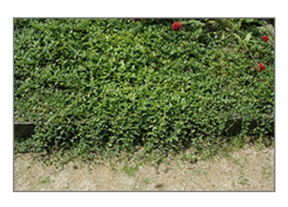
Bowles Cunningham Periwinkle

One of the very best groundcovers for deep shade, featuring showy sky blue flowers held over lustrous dark green evergreen foliage; does well in sun or deep shade, quickly forms a dense mat, even grows well under mature trees