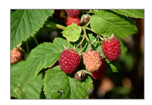
Latham Raspberry fruit

Latham Raspberry has rich green deciduous foliage on a plant with an upright spreading habit of growth. The fuzzy oval compound leaves do not develop any appreciable fall colour. It features an abundance of magnificent red berries in mid summer.