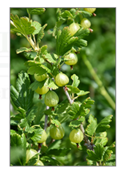
Captivator Gooseberry fruit