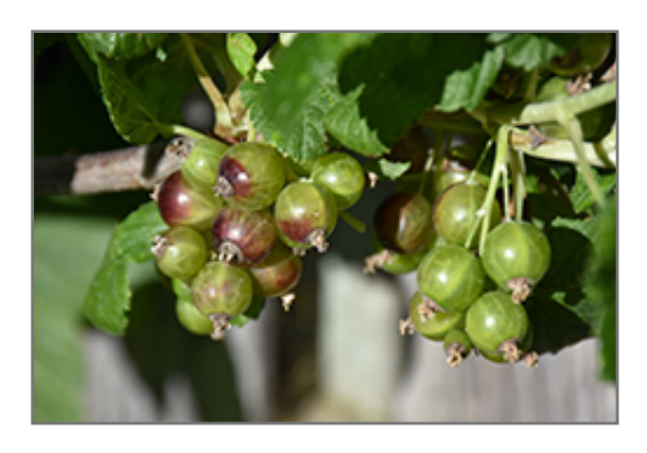
Captivator Gooseberry fruit