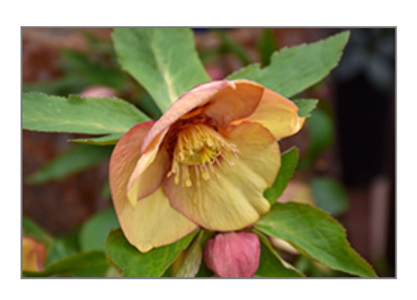
Winter Jewels Apricot Blush Hellebore flowers

This attractive variety produces bushy mounds of thick evergreen leaves; flower stalks, held above the foliage bear showy, cup shaped, peachy-apricot blooms with dark rose speckling, veining or picotee; a great selection for shade gardens