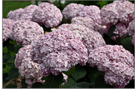
Incrediball Blush Smooth Hydrangea flowers (faded)

This shrub does best in full sun to partial shade. You may want to keep it away from hot, dry locations that receive direct afternoon sun or which get reflected sunlight, such as against the south side of a white wall. It prefers to grow in average to moist conditions, and shouldn't be allowed to dry out. It is not particular as to soil type or pH. It is highly tolerant of urban pollution and will even thrive in inner city environments. Consider applying a thick mulch around the root zone in winter to protect it in exposed locations or colder microclimates. This is a selection of a native North American species.