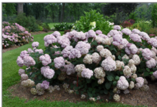
Incrediball Blush Smooth Hydrangea in bloom