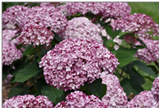
Incrediball Blush Smooth Hydrangea

Incrediball Blush Smooth Hydrangea is recommended for the following landscape applications;