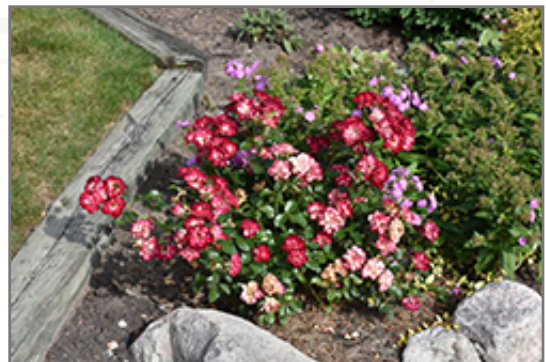
Never Alone Rose in bloom