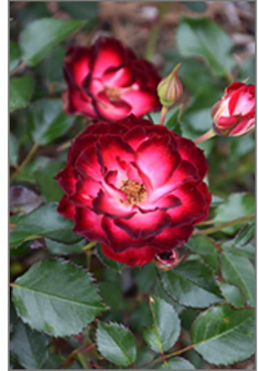
Never Alone Rose flowers

Never Alone Rose is a multi-stemmed deciduous shrub with an upright spreading habit of growth. Its average texture blends into the landscape, but can be balanced by one or two finer or coarser trees or shrubs for an effective composition.