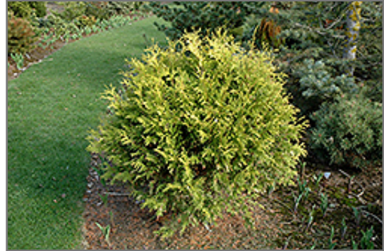
Golden Globe Arborvitae

This is a relatively low maintenance shrub. When pruning is necessary, it is recommended to only trim back the new growth of the current season, other than to remove any dieback. It has no significant negative characteristics.