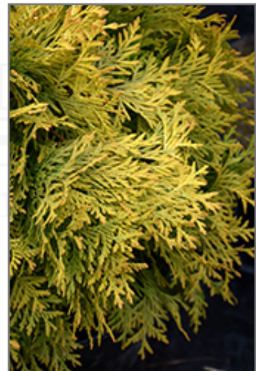
Golden Globe Arborvitae foliage