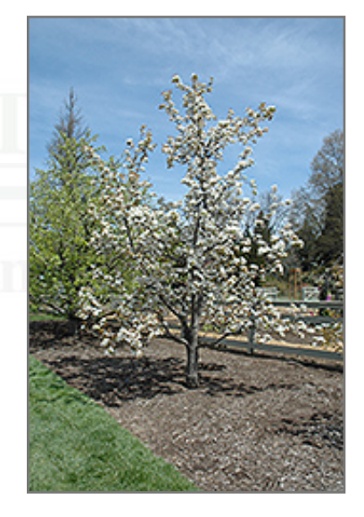
Chojuro Asian Pear in bloom