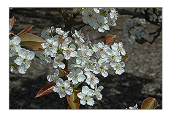
Chojuro Asian Pear flowers

Chojuro Asian Pear is clothed in stunning clusters of white flowers with pink anthers along the branches in early spring before the leaves. It has dark green deciduous foliage which emerges coppery-bronze in spring. The glossy pointy leaves turn an outstanding tomato-orange in the fall. The fruits are showy brown pears carried in abundance in late summer. The fruit can be messy if allowed to drop on the lawn or walkways, and may require occasional clean-up.