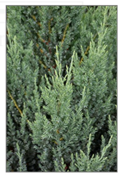
Blue Point Juniper foliage