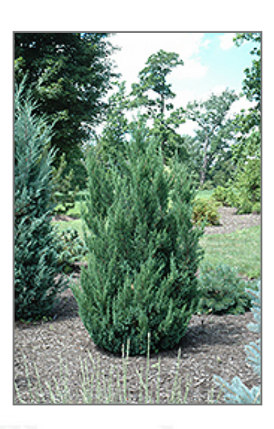
Blue Point Juniper

Blue Point Juniper is recommended for the following landscape applications;