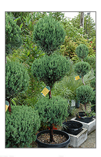
Blue Point Juniper (topiary form)

This shrub should only be grown in full sunlight. It is very adaptable to both dry and moist growing conditions, but will not tolerate any standing water. It is not particular as to soil type or pH. It is highly tolerant of urban pollution and will even thrive in inner city environments. This is a selected variety of a species not originally from North America.