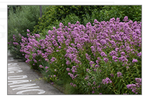
Jeana Garden Phlox in bloom