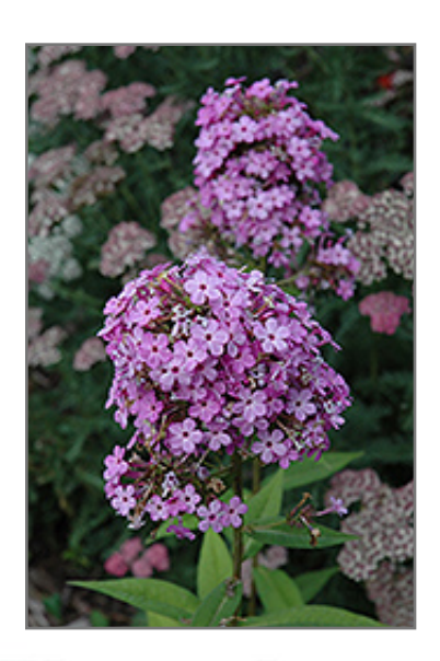
Jeana Garden Phlox flowers

Jeana Garden Phlox is a dense herbaceous perennial with an upright spreading habit of growth. Its medium texture blends into the garden, but can always be balanced by a couple of finer or coarser plants for an effective composition.