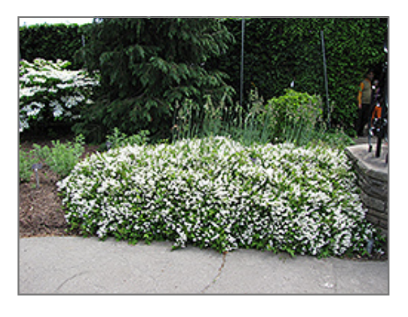
Nikko Deutzia in bloom

Nikko Deutzia is recommended for the following landscape applications;