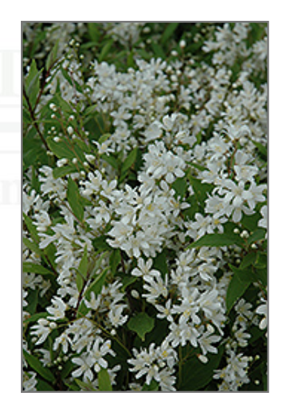
Nikko Deutzia flowers