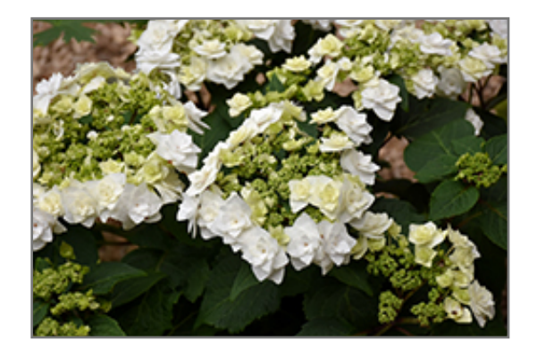
Wedding Gown Hydrangea flowers

Wedding Gown Hydrangea is a multi-stemmed deciduous shrub with a mounded form. Its relatively coarse texture can be used to stand it apart from other landscape plants with finer foliage.