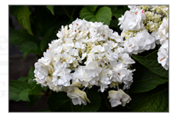
Wedding Gown Hydrangea flowers

This shrub will require occasional maintenance and upkeep, and should only be pruned after flowering to avoid removing any of the current season's flowers. It has no significant negative characteristics.