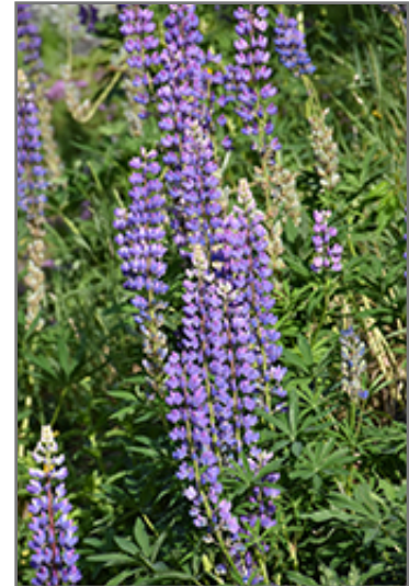
Wild Lupine flowers

A valued native variety producing spikes of eye catching flowers of blue-violet; a tremendous visual impact massed in the garden, border plantings or in containers