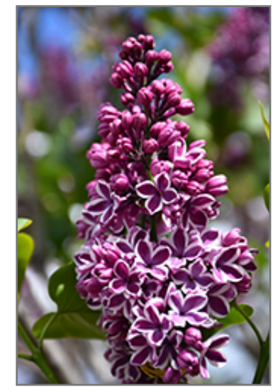
Sensation Lilac flowers

This is a high maintenance shrub that will require regular care and upkeep, and should only be pruned after flowering to avoid removing any of the current season's flowers. It is a good choice for attracting butterflies to your yard, but is not particularly attractive to deer who tend to leave it alone in favor of tastier treats. Gardeners should be aware of the following characteristic(s) that may warrant special consideration;