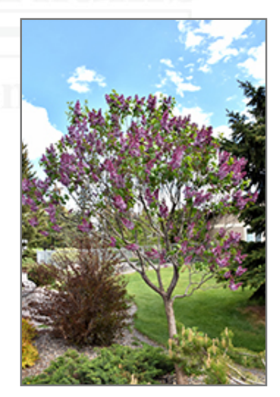
Sensation Lilac in bloom