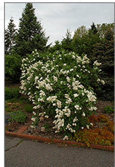
Mme. Lemoine Lilac in bloom