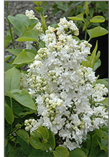
Mme. Lemoine Lilac flowers

This is a high maintenance shrub that will require regular care and upkeep, and should only be pruned after flowering to avoid removing any of the current season's flowers. It is a good choice for attracting butterflies to your yard, but is not particularly attractive to deer who tend to leave it alone in favor of tastier treats. Gardeners should be aware of the following characteristic(s) that may warrant special consideration;