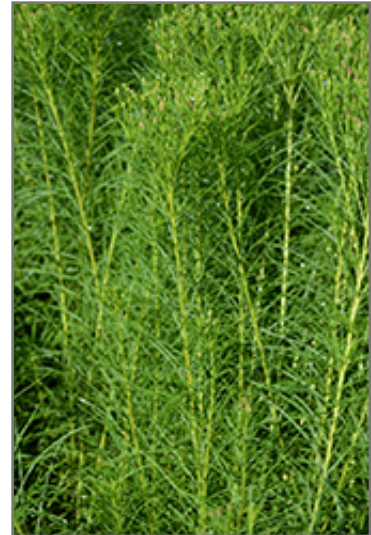
Narrowleaf Ironweed foliage

Narrowleaf Ironweed is recommended for the following landscape applications;