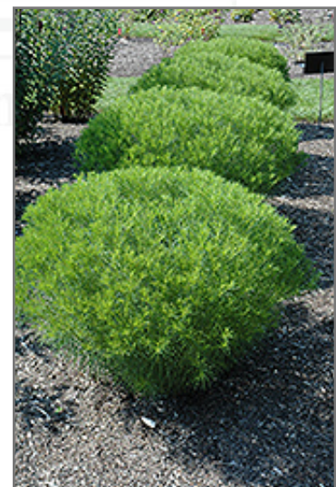
Narrowleaf Ironweed