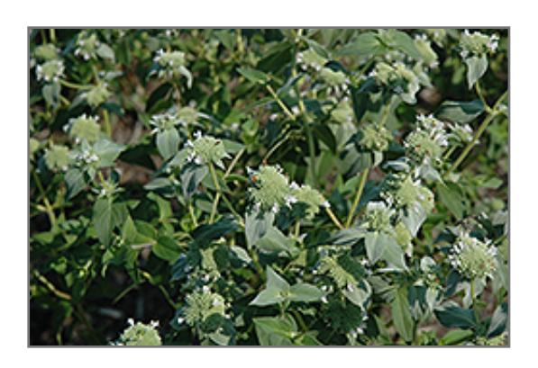
Short Toothed Mountain Mint in bloom

Short Toothed Mountain Mint is recommended for the following landscape applications;