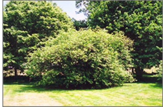
American Hazelnut

This plant is typically grown in a designated edibles garden. It performs well in both full sun and full shade. It is very adaptable to both dry and moist locations, and should do just fine under average home landscape conditions. It is considered to be drought-tolerant, and thus makes an ideal choice for xeriscaping or the moisture-conserving landscape. It is not particular as to soil type or pH. It is highly tolerant of urban pollution and will even thrive in inner city environments. This species is native to parts of North America.