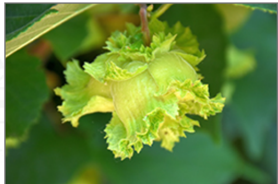
American Hazelnut fruit