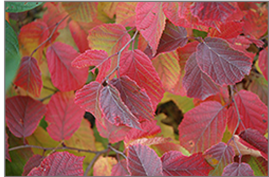
American Hazelnut in fall

American Hazelnut has dark green deciduous foliage on a plant with an upright spreading habit of growth. The serrated pointy leaves turn yellow in fall. It produces brown nuts in mid fall.