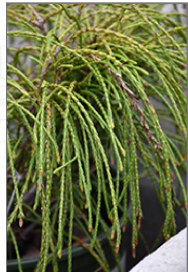
Whipcord Arborvitae foliage