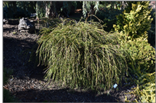
Whipcord Arborvitae

This shrub does best in full sun to partial shade. It prefers to grow in average to moist conditions, and shouldn't be allowed to dry out. It is not particular as to soil type or pH. It is somewhat tolerant of urban pollution, and will benefit from being planted in a relatively sheltered location. Consider applying a thick mulch around the root zone in winter to protect it in exposed locations or colder microclimates. This is a selection of a native North American species.