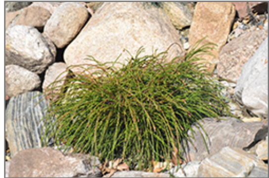
Whipcord Arborvitae

This is a relatively low maintenance shrub. When pruning is necessary, it is recommended to only trim back the new growth of the current season, other than to remove any dieback. It has no significant negative characteristics.