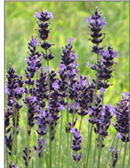
Hidcote Superior Lavender flowers

Hidcote Superior Lavender is a dense multi-stemmed evergreen shrub with a mounded form. It lends an extremely fine and delicate texture to the landscape composition which should be used to full effect.