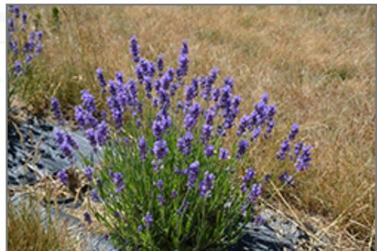
Hidcote Superior Lavender in bloom