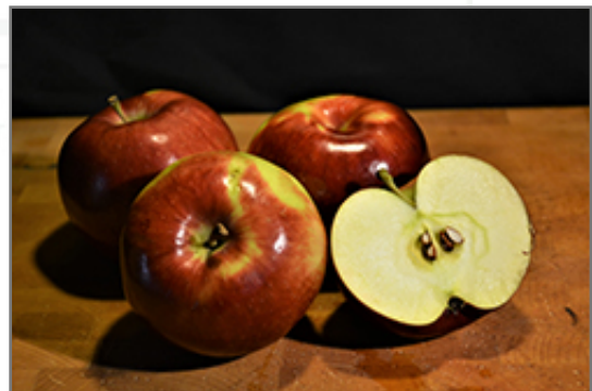
Empire Apple fruit and flesh