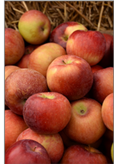
Empire Apple fruit