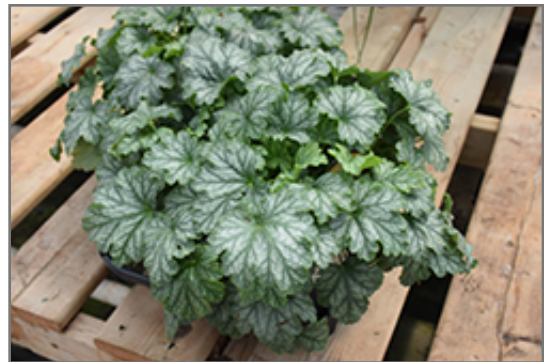
Paris Coral Bells foliage