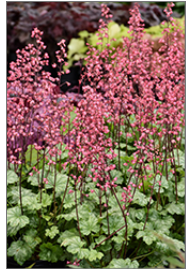
Paris Coral Bells flowers

Paris Coral Bells is recommended for the following landscape applications;