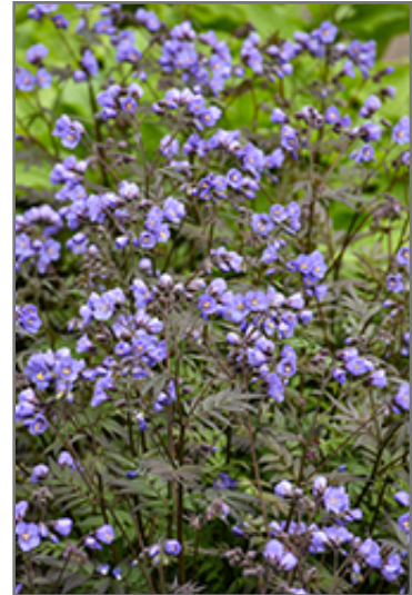
Heaven Scent Jacob's Ladder