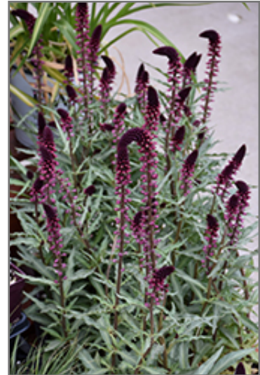
Beaujolais Loosestrife flowers