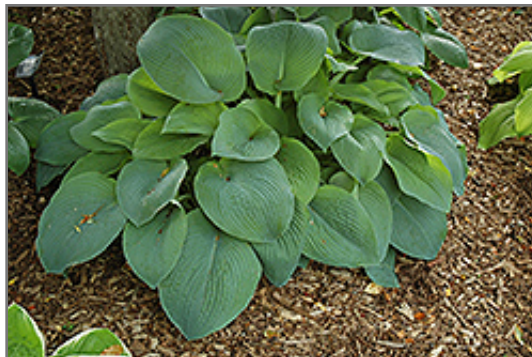
True Blue Hosta