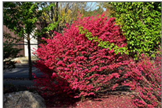
Little Moses Burning Bush in fall