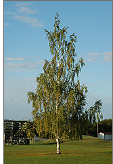
Cutleaf Weeping Birch

The Cutleaf Weeping Birch will grow to be about 40 feet tall at maturity, with a spread of 25 feet. It has a low canopy, and should not be planted underneath power lines. It grows at a fast rate, and under ideal conditions can be expected to live for 40 years or more.