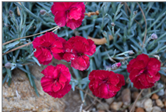
Frosty Fire Pinks flowers