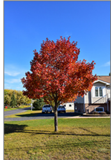
Northwood Red Maple in fall