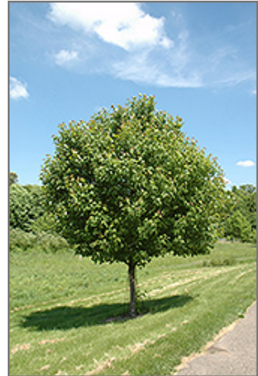
Northwood Red Maple

This tree should only be grown in full sunlight. It is quite adaptable, preferring to grow in average to wet conditions, and will even tolerate some standing water. It is not particular as to soil type, but has a definite preference for acidic soils, and is subject to chlorosis (yellowing) of the foliage in alkaline soils. It is somewhat tolerant of urban pollution. This is a selection of a native North American species.