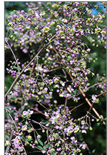
Rochebrun Meadow Rue flowers