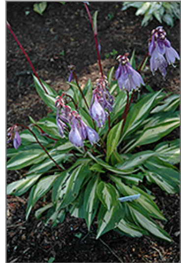
Cherry Berry Hosta in bloom

This plant does best in partial shade to shade. It prefers to grow in average to moist conditions, and shouldn't be allowed to dry out. It is not particular as to soil type or pH. It is somewhat tolerant of urban pollution. This particular variety is an interspecific hybrid. It can be propagated by division; however, as a cultivated variety, be aware that it may be subject to certain restrictions or prohibitions on propagation.