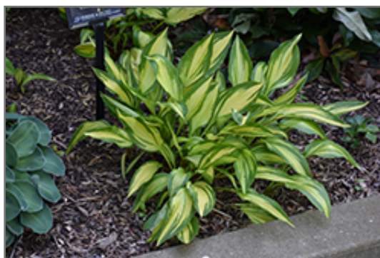
Cherry Berry Hosta