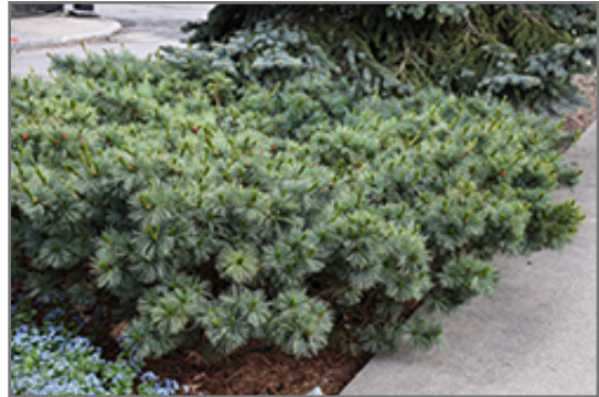
Blue Dwarf Japanese Stone Pine