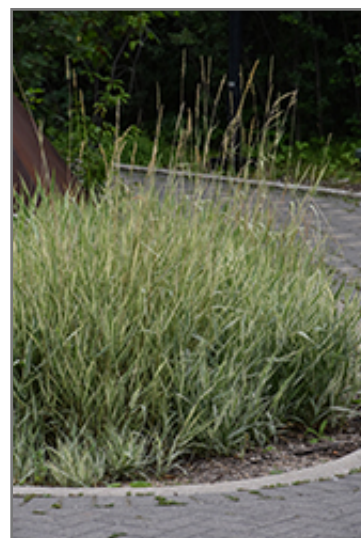
Strawberries And Cream Ribbon Grass in bloom

Strawberries And Cream Ribbon Grass will grow to be about 3 feet tall at maturity, with a spread of 3 feet. It grows at a fast rate, and under ideal conditions can be expected to live for approximately 20 years. As an herbaceous perennial, this plant will usually die back to the crown each winter, and will regrow from the base each spring. Be careful not to disturb the crown in late winter when it may not be readily seen!