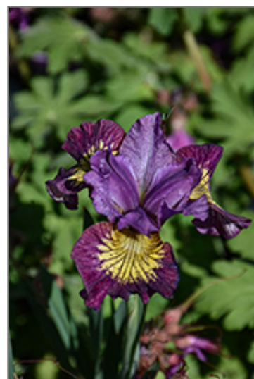
Miss Apple Siberian Iris flowers