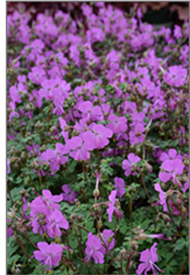
Intense Cranesbill flowers

Intense Cranesbill is recommended for the following landscape applications;