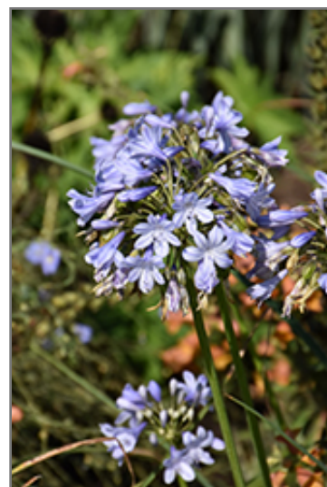
Charlotte Agapanthus flowers