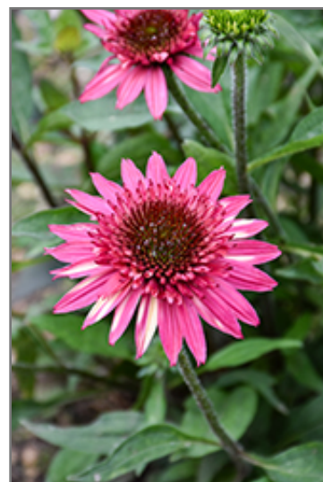
Giddy Pink Coneflower flowers