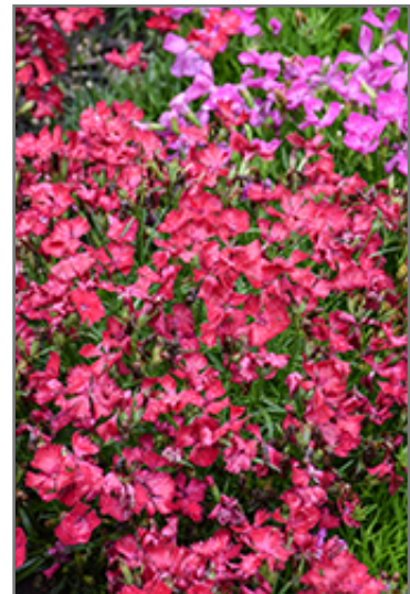
Beauties Tyra Pinks flowers