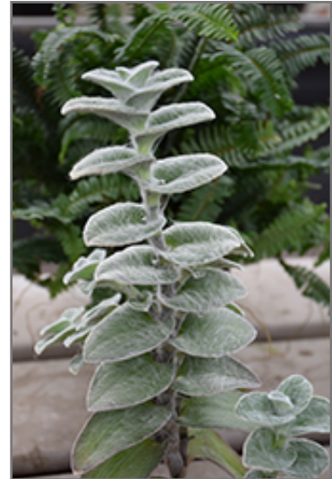
Cobweb Spiderwort foliage

This is an herbaceous evergreen houseplant with an upright spreading habit of growth. Its relatively fine texture sets it apart from other indoor plants with less refined foliage. This plant may benefit from an occasional pruning to look its best.