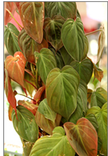
Velvet Leaf Philodendron foliage