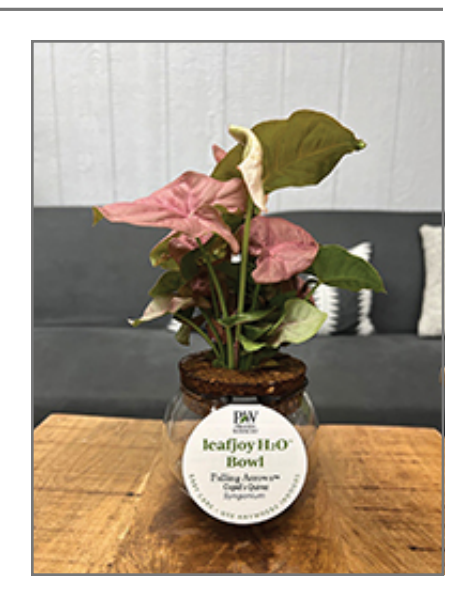
Falling Arrows Cupid's Quiver Arrowhead Vine in full

620 Goddard Ave. NE Calgary, AB, T2K 5X3 phone: 403-274-4286 www.goldenacre.ca