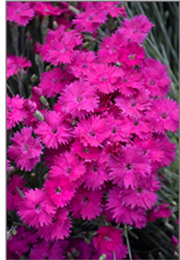
Neon Star Pinks flowers

Neon Star Pinks is recommended for the following landscape applications;