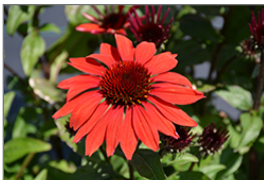
Panama Red Coneflower flowers

Panama Red Coneflower is recommended for the following landscape applications;