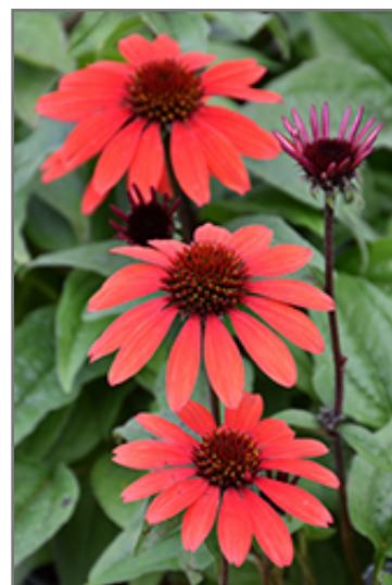
Panama Red Coneflower flowers

Panama Red Coneflower is a fine choice for the garden, but it is also a good selection for planting in outdoor pots and containers. It is often used as a 'filler' in the 'spiller-thriller-filler' container combination, providing a mass of flowers against which the larger thriller plants stand out. Note that when growing plants in outdoor containers and baskets, they may require more frequent waterings than they would in the yard or garden. Be aware that in our climate, most plants cannot be expected to survive the winter if left in containers outdoors, and this plant is no exception. Contact our experts for more information on how to protect it over the winter months.