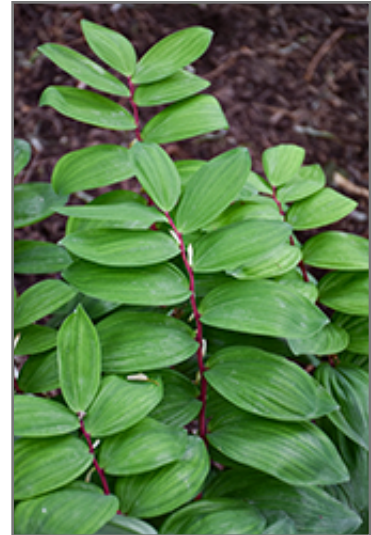
Ruby Slippers Solomon's Seal foliage