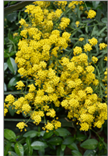
Golden Spring Alpine Alyssum flowers

Golden Spring Alpine Alyssum is a fine choice for the garden, but it is also a good selection for planting in outdoor pots and containers. It is often used as a 'filler' in the 'spiller-thriller-filler' container combination, providing a mass of flowers and foliage against which the thriller plants stand out. Note that when growing plants in outdoor containers and baskets, they may require more frequent waterings than they would in the yard or garden. Be aware that in our climate, most plants cannot be expected to survive the winter if left in containers outdoors, and this plant is no exception. Contact our experts for more information on how to protect it over the winter months.