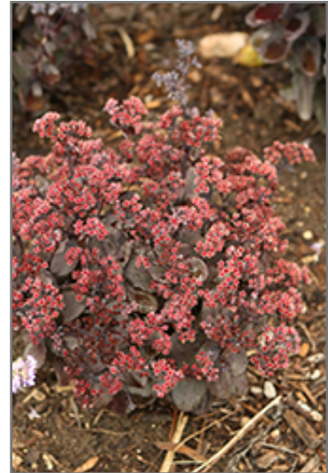
Rock 'N Grow Back in Black Stonecrop flowers

Rock 'N Grow Back in Black Stonecrop is a fine choice for the garden, but it is also a good selection for planting in outdoor pots and containers. With its upright habit of growth, it is best suited for use as a 'thriller' in the 'spiller-thriller-filler' container combination; plant it near the center of the pot, surrounded by smaller plants and those that spill over the edges. Note that when growing plants in outdoor containers and baskets, they may require more frequent waterings than they would in the yard or garden. Be aware that in our climate, most plants cannot be expected to survive the winter if left in containers outdoors, and this plant is no exception. Contact our experts for more information on how to protect it over the winter months.