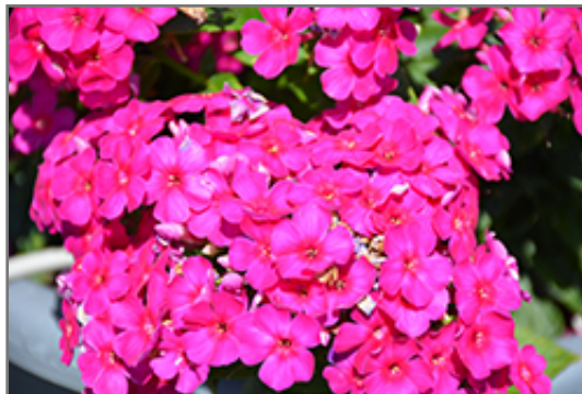
Early Cerise Garden Phlox flowers